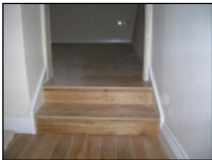
Above: steps to bedroom 2