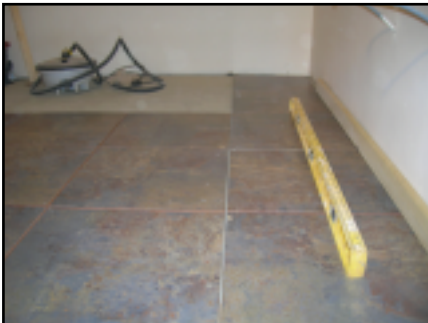
Above: bathroom tiles at Broadwell