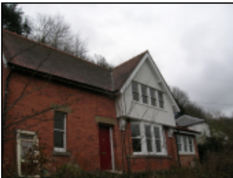
Above: our Bishopswood cottage

Working in such an old property means making a series of compromises between Victorian character and modern comfort - and the bathroom illustrates this more clearly than any other room in the house.