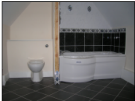
Above: bathroom at Bishopswood