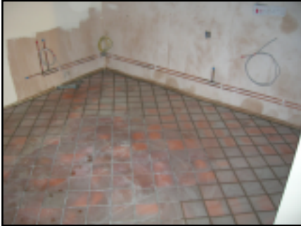
Above: kitchen tiles going down

We are currently tiling the hallway, kitchen and utility room with six-inch brown quarry tiles, and will install the kitchen shortly.