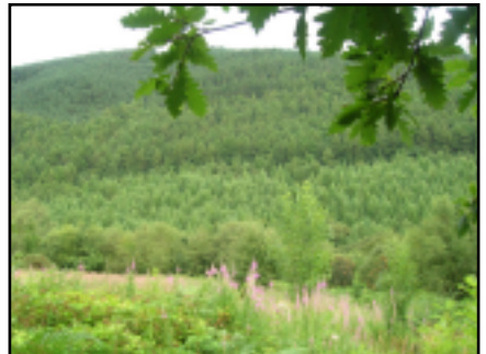
Above: north view in Wales

Preparing to launch this project is proving to be something of a marathon.