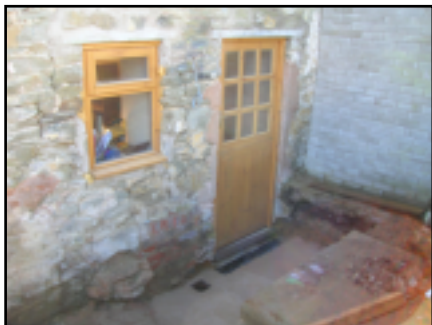
Above: front of house at Broadwell