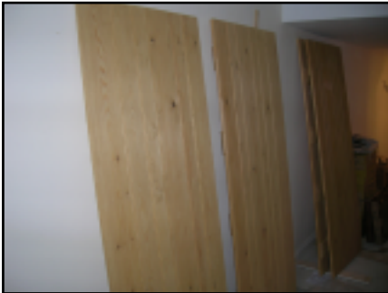
Above: internal doors waiting to be hung