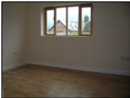
Above: bedroom 2

The area in front of the cottage has received some attention too. We hired a groundwork contractor to remove and crush the final bits of the old lean-to shed: a thick slab of concrete and the last section of wall.