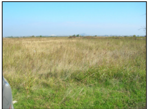
Top: Giroma Rental Manager, Middle: One of our rental properties, Bottom: Bulgaria