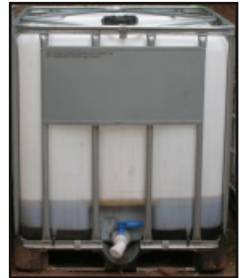
Some of our biodiesel equipment